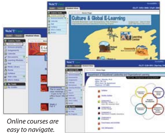
Online courses are easy to navigate.

International and non-resident online students can pay resident tuition fees if they enroll in no more than six credit hours per semester.